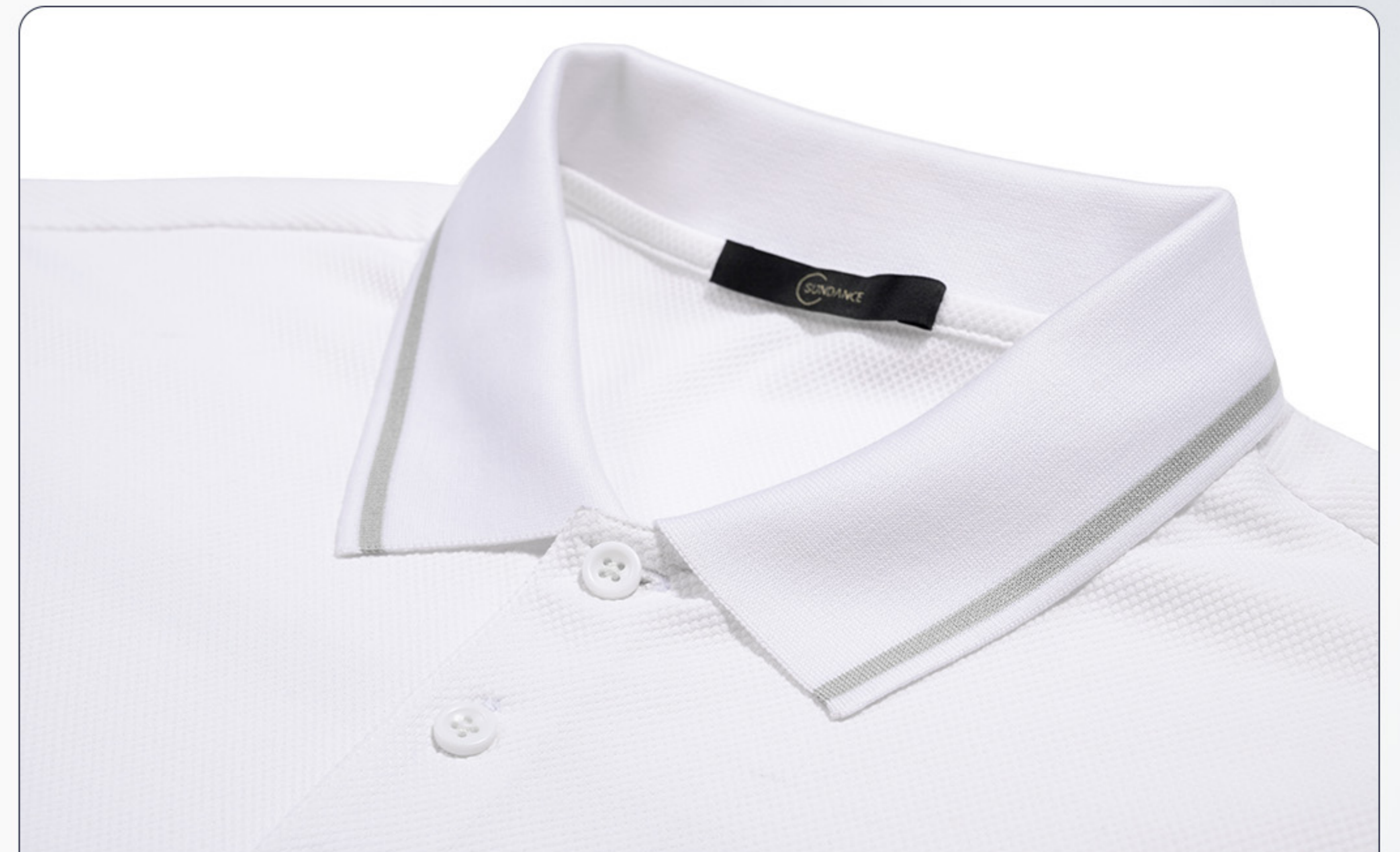
3D three-dimensional weaving

This product combines ergonomics, uses 3D three-dimensional knitting, fits the human body curve, is crisp and stylish, and is comfortable to wear without tension, highlighting the cleanliness. Classic business version, elegant without losing taste. Open shoulder free movement design, from the shoulder to the tail of the fine consideration, the pursuit of extreme detail, not easy to deform, vertical and natural.